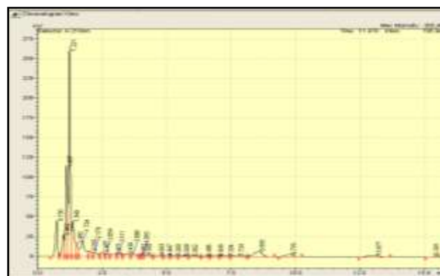
Fig. 5 : HPLC chromatogram of H. isora L. callus extract

\beta -sitosterol was quantitatively evaluated in different samples by HPLC analysis. Standard \beta -sitosterol showed a peak at 1.304 min retention time (Figure 2). HPLC of the nature grown and in vitro regenerant's bark and callus showed multiple peaks, indicating the presence of several compounds.