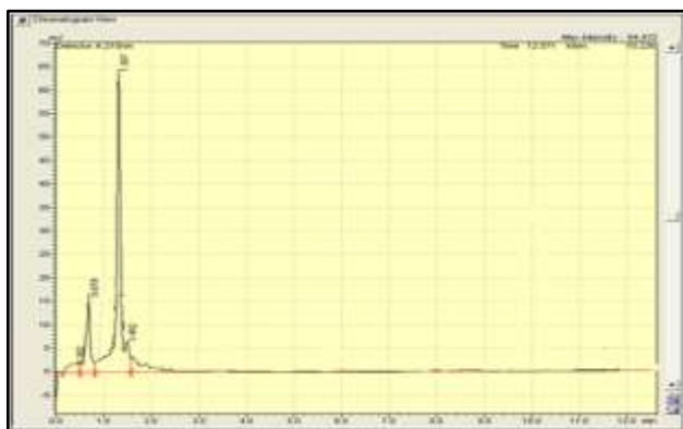
Fig. 2: HPLC chromatogram of standard \beta -sitosterol