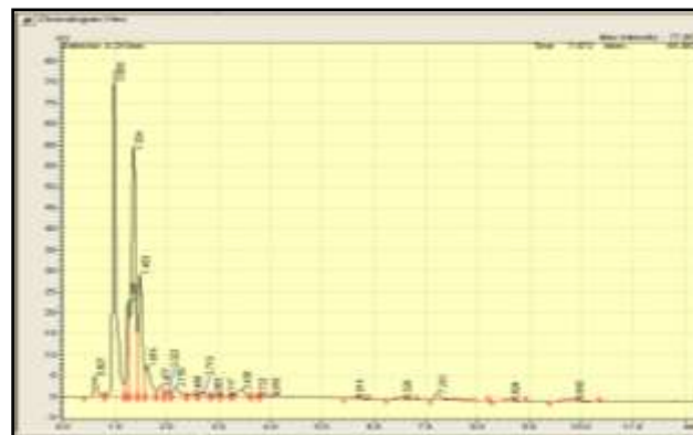
Fig. 4: HPLC chromatogram of H. isora L. in vitro regenerated bark extract

also showed various additional spots between an R_f value of 0.04 to 0.63 with maximum spots being observed in the callus sample thus indicating the presence of several compounds in the sample (Figure 1 B).