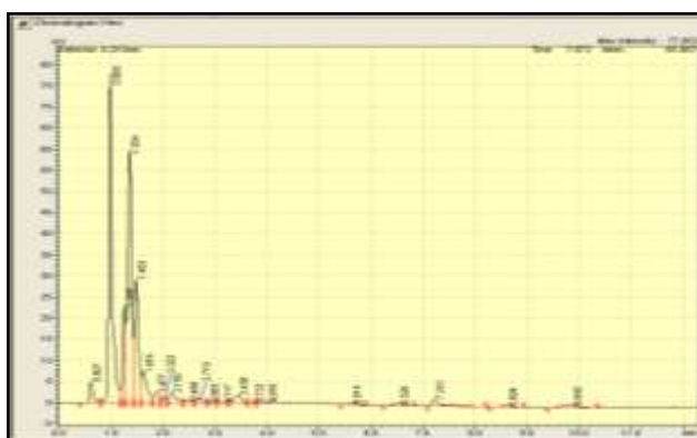
Fig. 3: HPLC chromatogram of H. isora L. nature grown bark extract