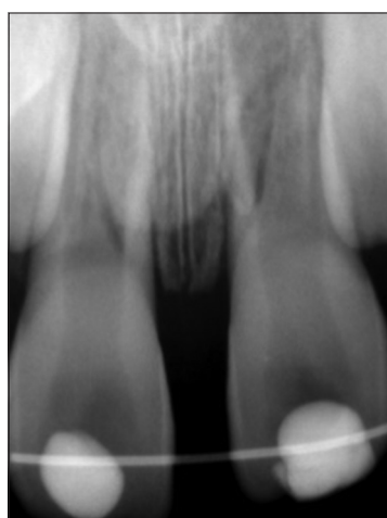
Fig. 2: A radiographic scan of the patient a month later