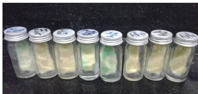
Fig. 2: Drug susceptibility testing performed in Lowenstein Jensen medium using absolute concentration method