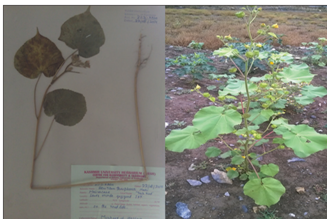
Fig. 1: Abutilon theophrasti

Data were statistically analyzed, and the level of significance was tested following the two-way analysis of variance.