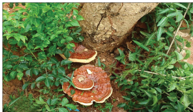
Fig. 1: Ganoderma lucidum (Test mushroom)

The total protein contents of the aqueous extract of G. lucidum were found to be 39.28 mg/g.wet.wt. After acid extraction, the protein