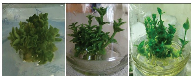
Fig. 4: Florets developed in solid and liquid media from the callus in 20 days