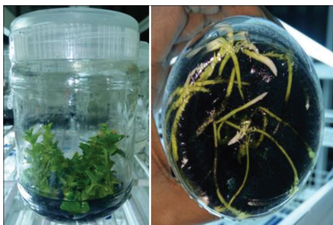
Fig. 5: Plantlets bearing roots grown in the rooting medium with activated charcoal