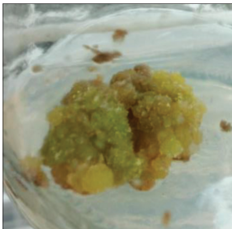
Fig. 3: Callus developed from leaf explants