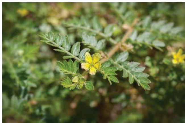
Fig. 1: Tribulus terrestris