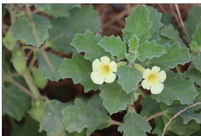
Fig. 2: Pedalium murex