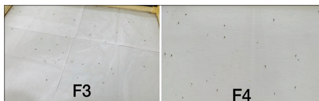
Fig. 5: Mosquitoes with no movement and lying on the floor