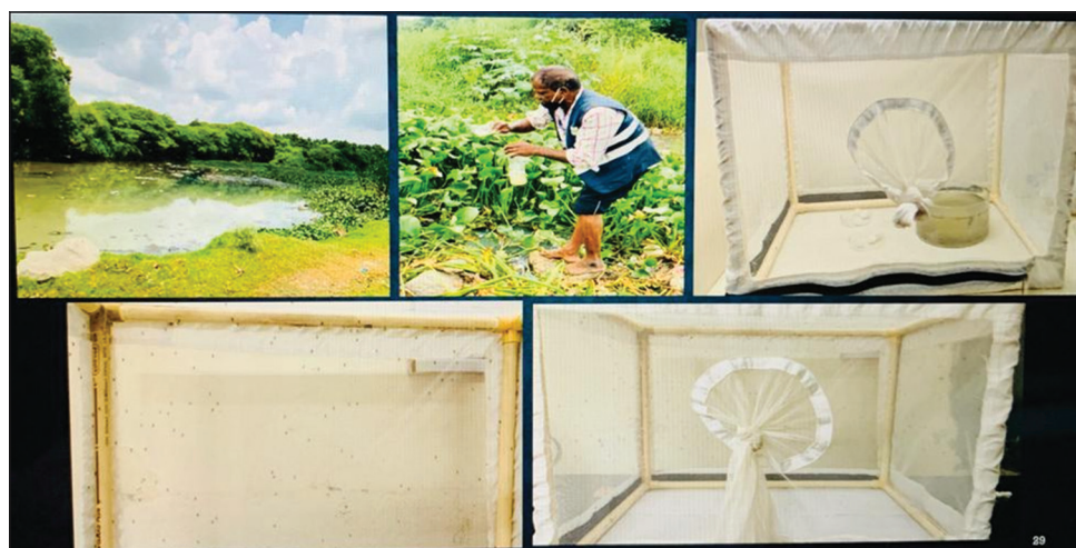
Fig. 2: Collection and rearing of mosquitoes

The viscosity of the formulated gel was determined using the digital Brookfield viscometer using spindle no. 64 at 10 rpm and temperature of 25±1°C. The corresponding dial reading was noted [16].