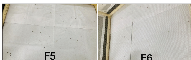
Fig. 6: Mosquitoes with no movement and lying on the floor