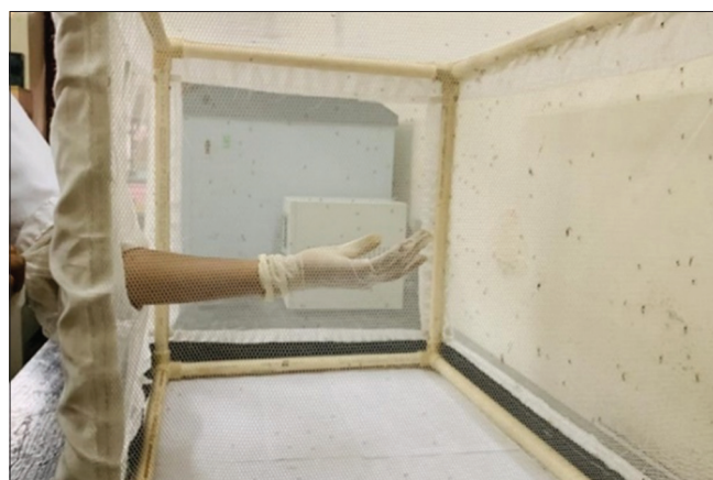
Fig. 4: Mosquito-repellent activity - Treated arm