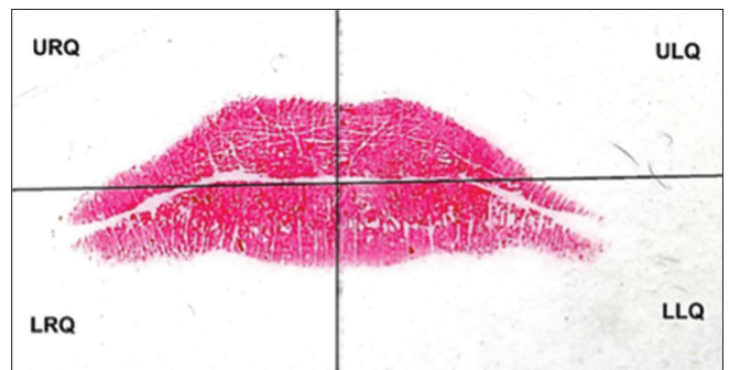
Fig. 5: The lip prints of each subject were divided into four quadrants upper right quadrant, upper left quadrant, lower right quadrant, and Lower left quadrant showing type I lip print