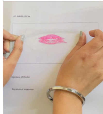
Fig. 4: Method of application of cellophane tape containing the lip print to the white paper