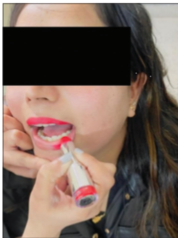
Fig. 2: Method of application of lipstick on lower lip starting from middle to left lateral end of lower lip