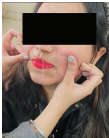
Fig. 3: Method of application of cellophane tape on lips