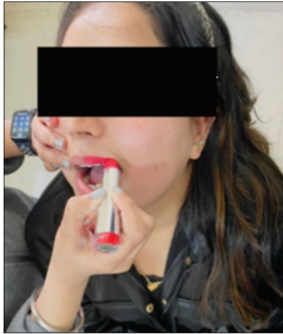
Fig. 1: Depicts method of application of lipstick from middle to left lateral end of the upper lip