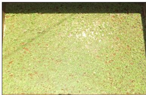
Fig. 1: Mass multiplied Azolla Species

Azolla is a free floating aquatic fern, which can be widely found in freshwater environments in temperate and tropical regions all over the world. It ranks among the fastest growing crops on earth and due to its association with the nitrogen fixing Cyanobacteria Anabaena azollae , it is independent of external organic nitrogen. In that way Azolla species is not only known to fix huge amounts of carbon, but as well to produce vast amounts of organic nitrogen. The nutrient, which mainly limits the growth of Azolla , is phosphorous. Azolla comes under the family of Salviniaceae [13]. In the present study the procured strains of Azolla were mass multiplied under controlled condition (FIG 1) without Lemna species contamination. The dead Azolla cultures were removed periodically in order to enhance the oxygen content for a time. The well grown Azolla cultures have been treated with the selected paddy cultivars for 21 days.