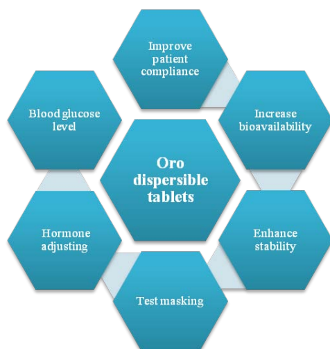
Fig. 2: Objective of oro dispersible tablets

A proprietary taste-covering method is used with inside the method of Oraquick fast-dissolving/disintegrating tablets. Since there aren't any solvents used in this flavour covering procedure, production is speeded up and made greater effective. This approach is suitable for medicinal drugs, which might be touchy to warmness seeing that low warmness is created at some stage in processing. Microencapsulated particle is allegedly greater malleable, consistent with KV Pharmaceuticals. This approach produces tablets that quickly dissolve and cover awful tastes in multiple seconds [51].