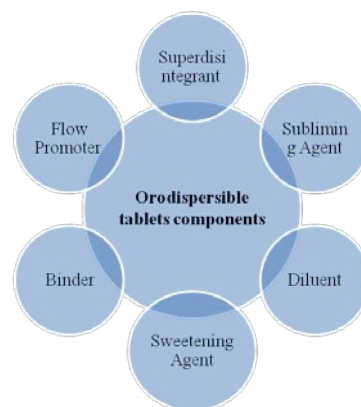
Fig. 1: Components of orodispersible tablets

Springer Link, Research Gate, PubMed, and Shodhganga. Libraries of the CD Bioparticles Drug Delivery, Natural Polymer Chemical Research Group, Polymer Science and Technology, CSIR, Natural Polymer and Biomimetics, CiMUS, Polymer Processing Research Centre. Utilising keywords like polymer, natural polymers, polymer synthesis, polymerization, polymer characterization, application of polymer, properties of polymer, polymer processing, natural polymer sources, orodispersible tablets, conventional tablets. Based on the titles and abstracts, the authors did a preliminary review of the papers, finding 164 entries in databases and 32 records from other sources. Also performed the descriptive literature review from year 1990 to 2023. Studies describing the usage of polymer for therapeutic purposes were the only ones included; those describing just views, attitudes, or beliefs of people or groups regarding the therapeutic drug delivery potential were included.