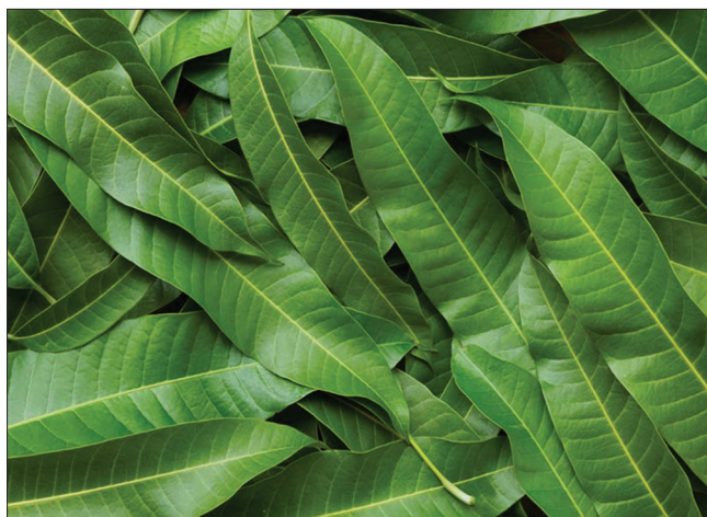
Fig. 1: Mangifera indica leaves