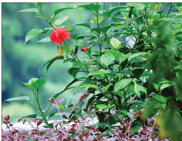
Fig. 2: Hibiscus rosa-sinensis leaves