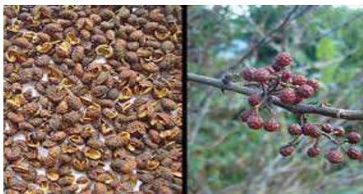
Fig. 1: Zanthoxylum armatum seeds

Zanthoxylum armatum , locally known as Boke Timur and Aankhe Timur , is a deciduous shrub or a small tree, around six meters tall or higher, with dense foliage, armed branched flattened prickles, yellow flowers and red seeds. Belonging to Rutaceae , it naturally occurs in Nepalese forests and on open sites at altitudes ranging from 1000 to 2100 meters and can be found in different management systems. As suggested by the peoples who are cultivating this plant, certain environments are better for grow, such as sites with deep, well-drained moist soils in full sun or semi-shade. This can explain the occurrence of Zanthoxylum armatum shrubs or small trees around cultivated crop fields [5].