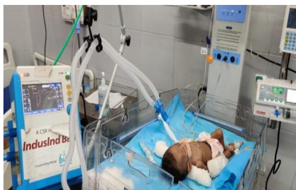
Fig. 1: Neonatal ventilation

The majority of subjects belonged to <1 month of age (77.58%) (table 1 and fig. 2).