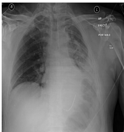
Fig. 4: Chest X-ray showing ventilator-associated pneumonia

The mean hospital stay was found to be 22.88 \pm 7.96 d. Whereas the mean hospital stay in patients without complications was significantly less compared to patients with complications ( 18.57 \pm 10.09 d vs 27.19 \pm 5.83 d, P=0.00015 ). The mortality rate was found to be 47.27%.