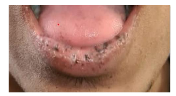
Fig. 2: Photograph showing blackish discolouration of lips