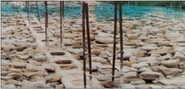
Fig. 2: Concrete block foundation with enforcement bar and hardcore in the study area.