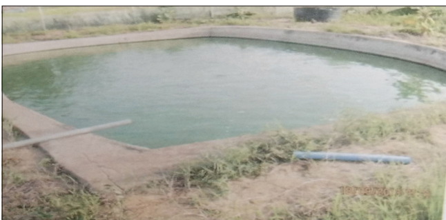
Fig. 4: Concrete fish pond ready for stocking in the study area.

The few skilled farmers and the fisheries personnel of the Federal College of Freshwater Fisheries Technology, Baga, Maiduguri responded; with the aid of demonstration; concrete pond foundation is constructed with concrete block with enforcement bars and hardcore required under the ground level below formation of the floor slab and the walls. On top of the concrete pond floor slab, concrete pond walls are built after placing the water outlet pipes. Preferably, the outlet pipe is placed below the slab with an elbow joint. The concrete pond floor slab is made from cement, stone chips, and sand in a proportion of (1:2:4)