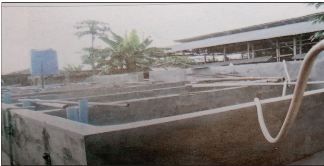
Fig. 3: Well manage newly constructed concrete fish ponds in the study area.