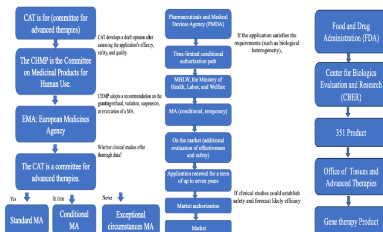
Fig. 2: Approval pathway of GTP and RMP in EU, Japan and the USA consulting with agencies