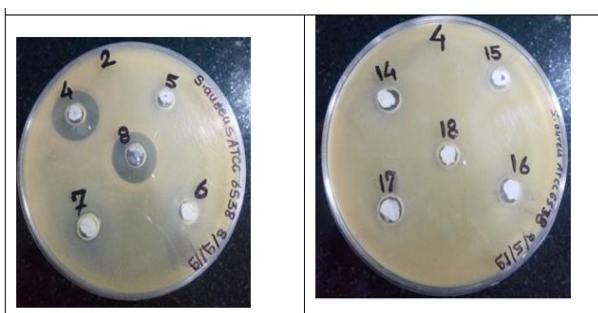
Staphylococcus aureus Slant ATCC no.6538