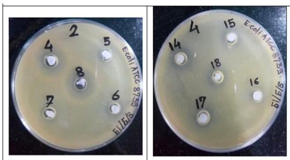
Escherichia coli ATCC no. 8739.

3. Antifungal complexes ( Candida albicans ) - Indicated by YELLOW