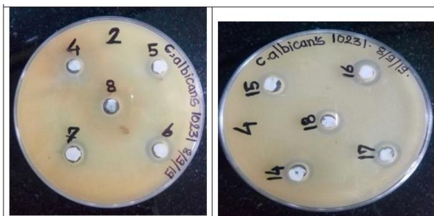
Candida albicans Slant ATCC no. 10231